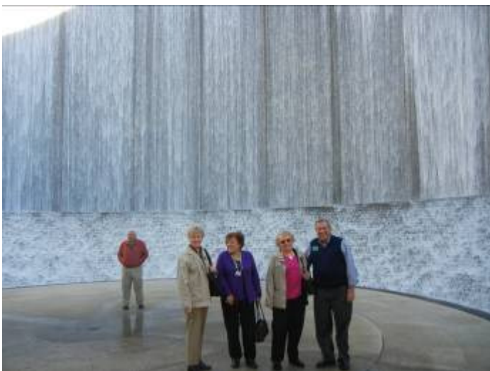
Galleria's Water Wall