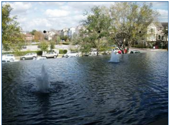
Eternity Pool on second floor