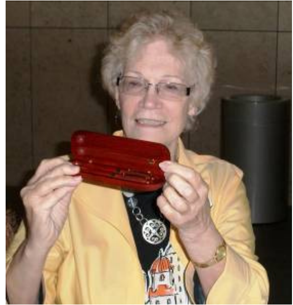
Presentation of Past President's Thank You Gift