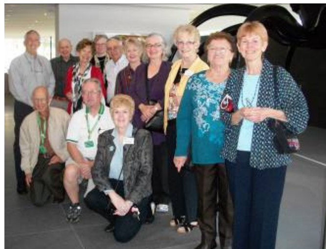
The Whole Gang by sculpture