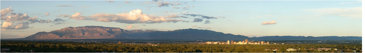
A panoramic view of the city of Albuquerque